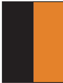
HALF PAGE VERTICAL