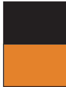
HALF PAGE HORIZONTAL